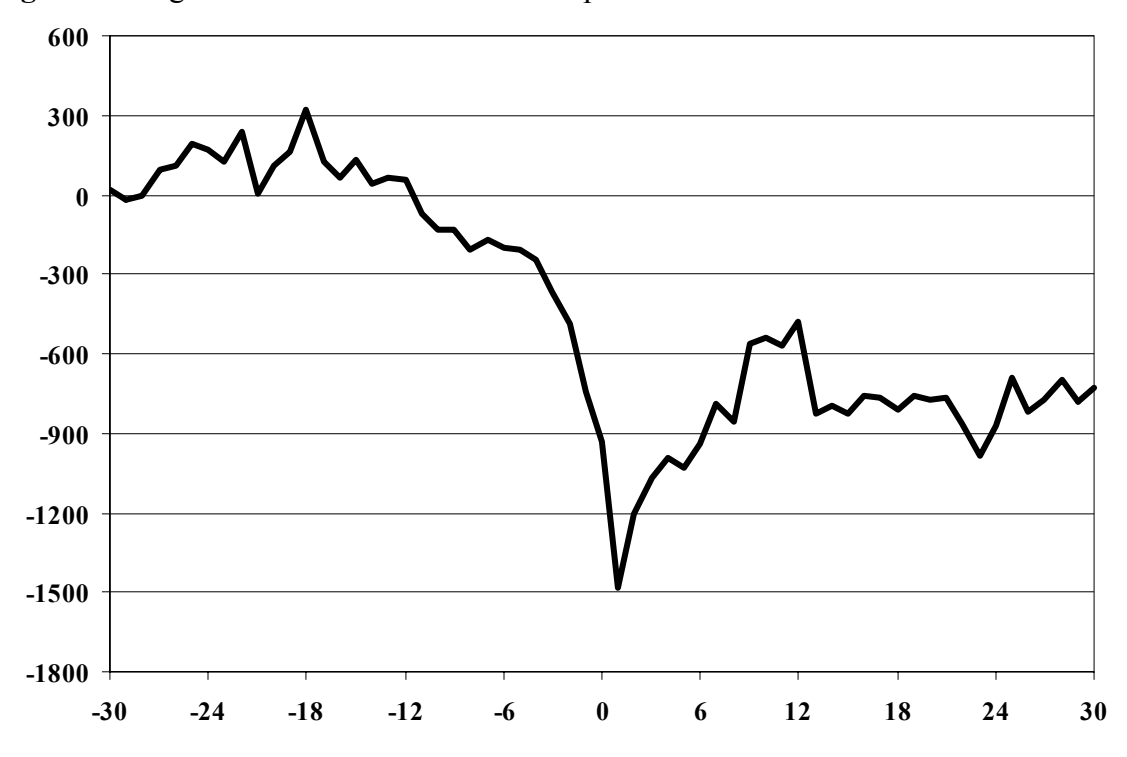
Figure 1: Wage Loss Around the Time of Displacement